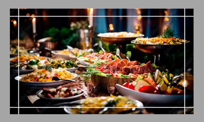
£24.95 per person

Classic mini scones with cream and strawberry jam (v)