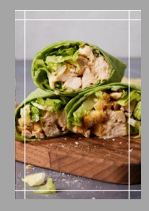
Delivered fresh on daily basic.

Chorizo, mozzarella, pesto with mixed leaf Crispy chicken and smashed avocado Chipotle salsa chicken, mixed leaf wrap Tuna, cucumber, mayo wrap Spicy sriracha, tuna wrap Chicken Caesar salad wrap Southwestern wrap Hummus rainbow wrap (ve) Ultimate falafel wrap (ve) Caramelized tofu, lettuce wrap (ve) Vegan BLT wrap (ve)